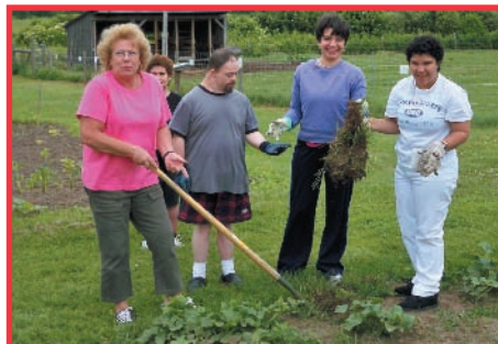
Gardeners at Bray Farm

There are many enthusiastic gardeners at Community Connections this summer, involving the people we serve in good outdoor exercise, "green gardening" and nutritional learning. A few examples include the Somerset Day Center's "Garden Club" that gathers every Wednesday, consisting of clients, staff and volunteers from the Somerset Garden Club. The volunteers have donated vegetable and herb seedlings and their valuable time.