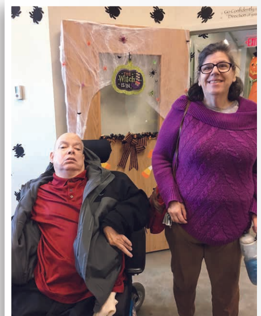
Members of the Mashpee Day Center Aktion Club of the Mashpee Kiwanis Club.