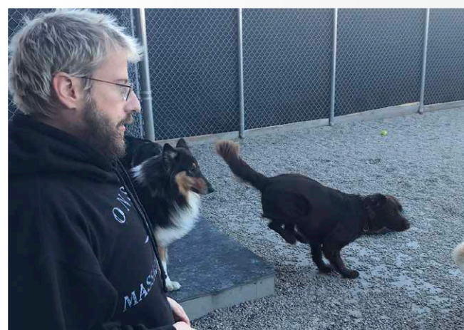
Fairhaven Day Center participant volunteers at a local doggie day care center.