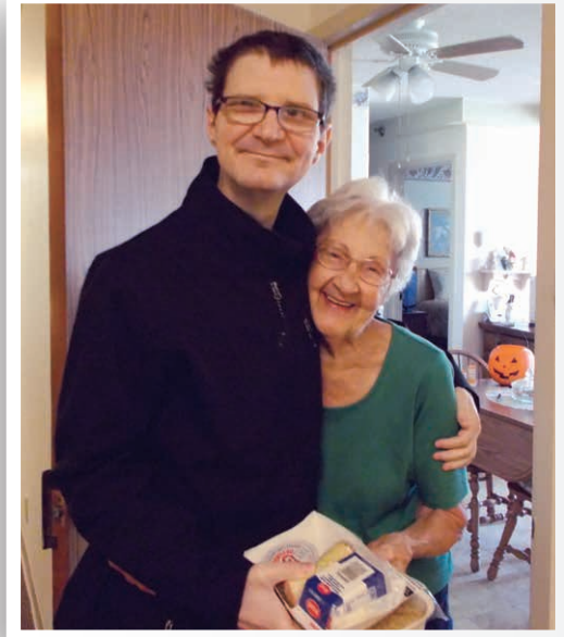
A Davol Street Day Center member deliver Meals on Wheels.