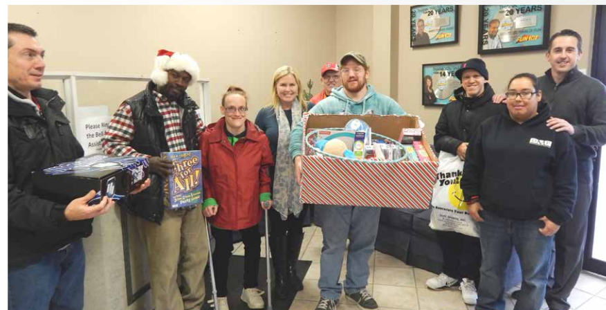
A group from the Fairhaven Day Center helps out with the Fun107 Toy for Tots drive.