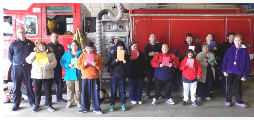
A group from the Plymouth Day Center shows their appreciation for Plymouth Fire Department.